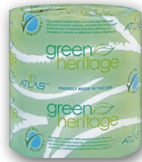
#115 - #125

Atlas Green Heritage® 1-Ply tissue is white, soft, absorbent, overall embossed and individually wrapped. Safe for all septic systems. Atlas Green Heritage Green Seal™ tissue products are made from 100% recycled fiber and bear the ultimate mark of environmental responsibility certifying that these products meet the Green Seal environmental standards for tissue products.